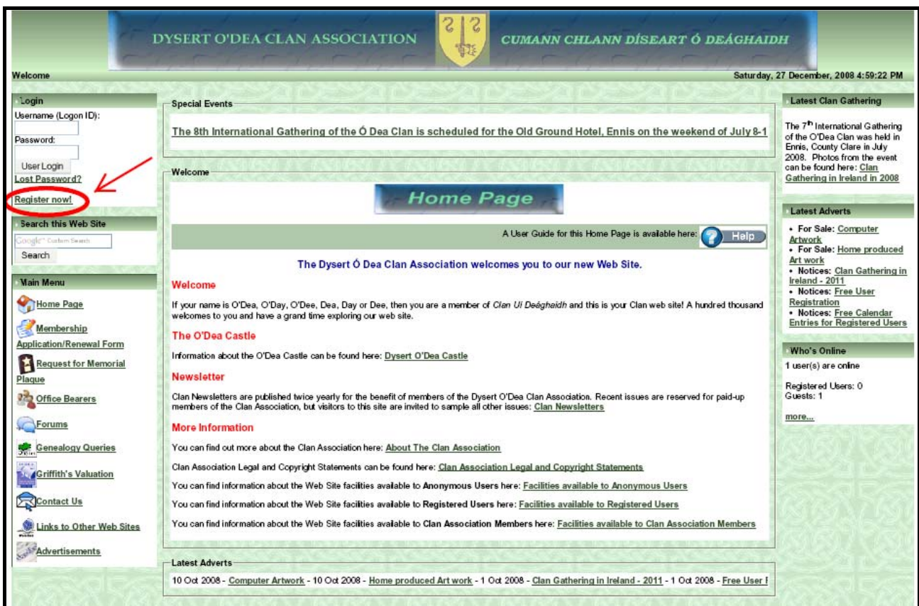
Figure 1: Register now! Menu Item on the Home Page

The diagram in Figure 1 shows where to find the Register now! menu item on the Home Page.