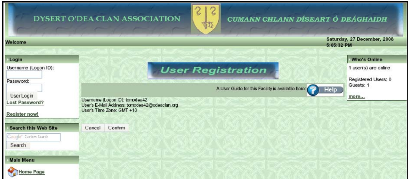
Figure 4: User Registration Confirmation Page

The diagram in Figure 4 shows the User Registration Confirmation Page.