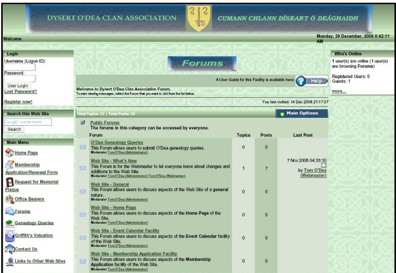
Figure 2: Sample Forums Page