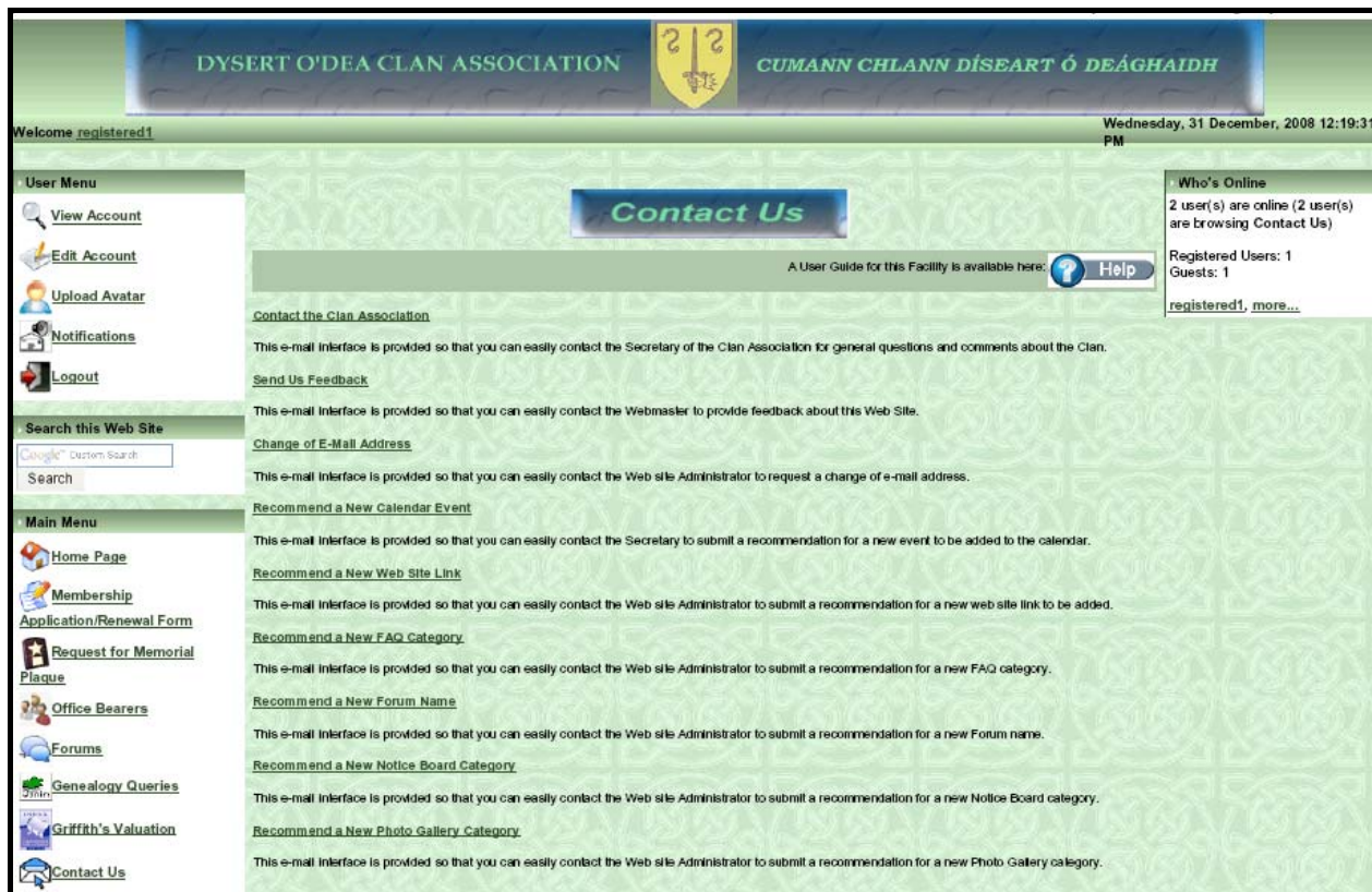
Figure 2: Sample Contact Us Page - Registered Users