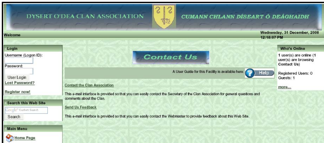
Figure 1: Sample Contact Us Page - Anonymous Users